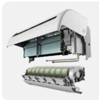
Quick access fan

The D Series design innovation extends to elements of maintenance as well. Featuring a unique, slide out chassis design, the indoor unit allows for convenient access and the opportunity to save time during maintenance.