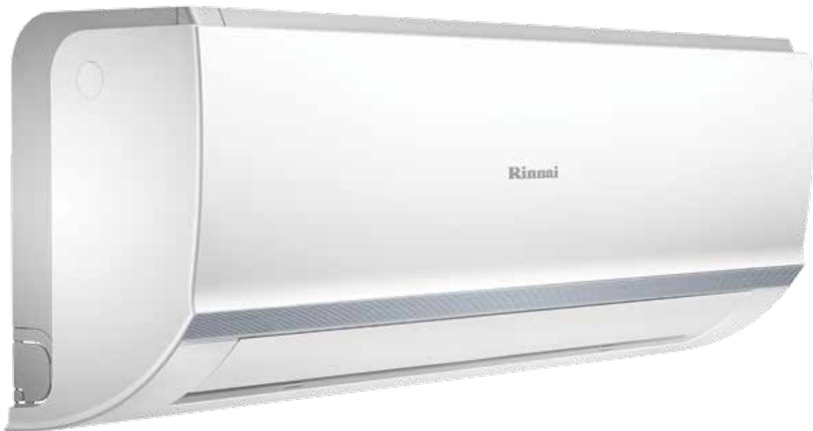
Indoor Header unit