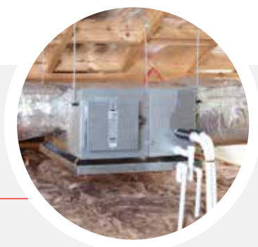
Indoor Fan Coil Unit installed within a roof space