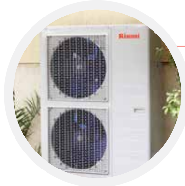
Outdoor Condensing Unit

A typical installation includes a system of insulated duct work distributing conditioned air throughout the entire home.