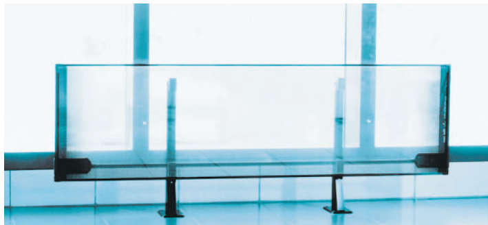
Clear glass • horizontal • floor mounted