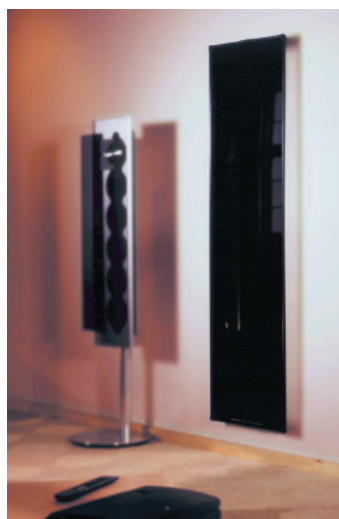
Black • vertical • wall mounted