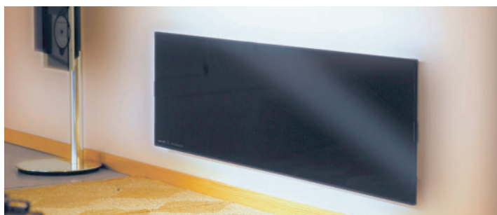
Black • horizontal • wall mounted

NOBO Safir is made from two 4mm glass sheets joined together. The front of the rear plate has an invisible electrically conducting layer. This emits the heat, while the temperature distributes evenly over the whole of the panel. The front plate acts as an electrical and mechanical protection.