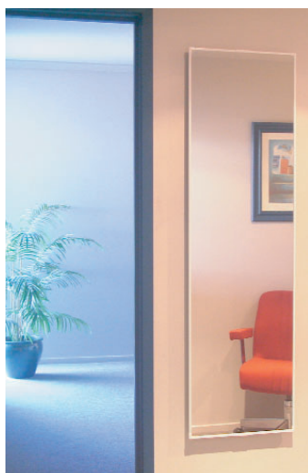
Mirror • vertical • wall mounted